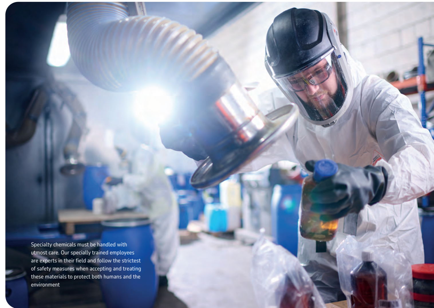
Specialty chemicals must be handled with utmost care. Our specially trained employees are experts in their field and follow the strictest of safety measures when accepting and treating these materials to protect both humans and the environment

One of the main advantages of the Bramsche Industrial Recycling Centre is its ability to directly incinerate materials in its hazardous waste incinerator