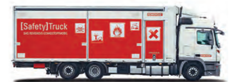
REMONDIS' special hazardous waste collection truck

We have a whole range of specialist vehicles – enabling us to select the best transport system for each type of material