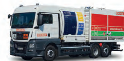
Our MOBIWER truck