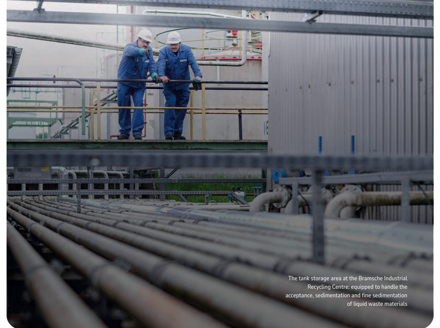
The tank storage area at the Bramsche Industrial Recycling Centre: equipped to handle the acceptance, sedimentation and fine sedimentation of liquid waste materials