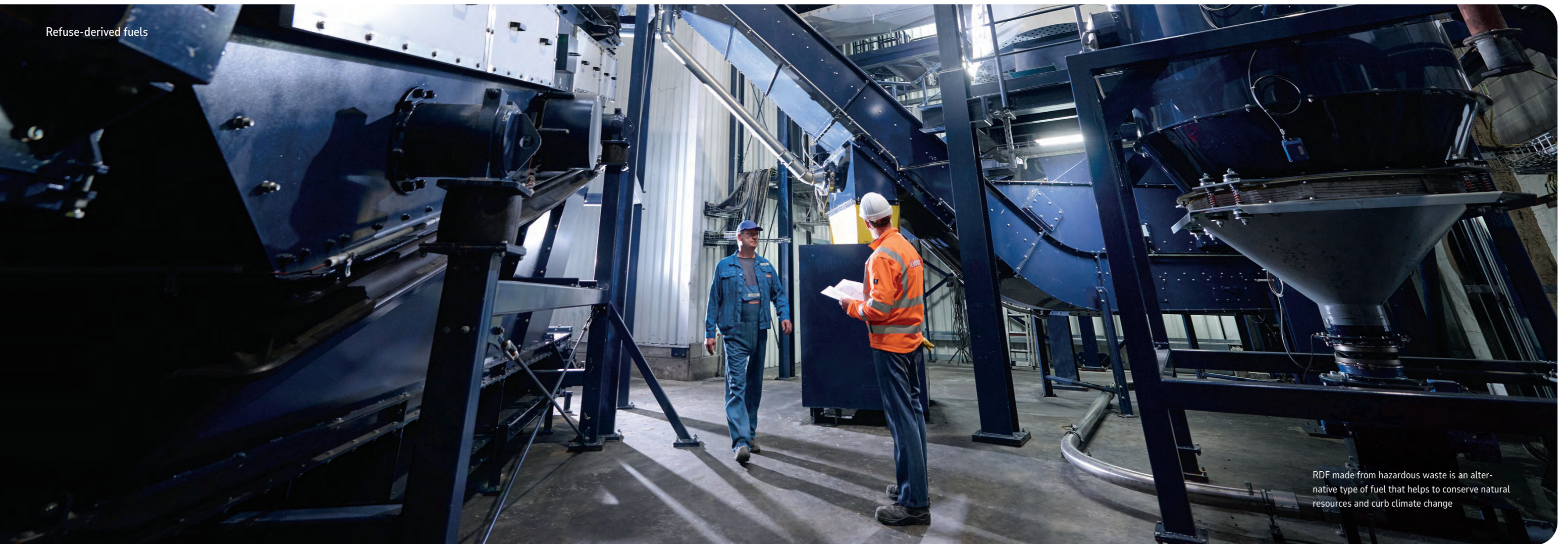
RDF made from hazardous waste is an alternative type of fuel that helps to conserve natural resources and curb climate change