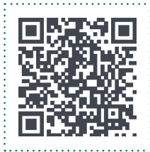
Take a look at our fleet of vehicles.

Being part of the REMONDIS family, we have all the specialist vehicles and storage systems needed to enable us to handle all types of hazardous waste. With our vehicles being ADR approved and manned and equipped in line with the TRGS [Technical Rules for Hazardous Substances], we can approach firms and institutions across Germany efficiently and sustainably. Moreover, we store and transport hazardous waste in our innovative bins and containers that are designed to mitigate the potential risks.