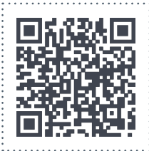
Find out more about our range of specialist bins and containers online.

whole chain of waste management for practically every type of waste. Our large portfolio of services makes it possible for us to operate as a one-stop shop for professional, regional and environmentally sound waste management solutions. By doing so, we not only ensure that we can reliably deliver our services wherever they are needed but also that each and every customer has their own dedicated contact person.