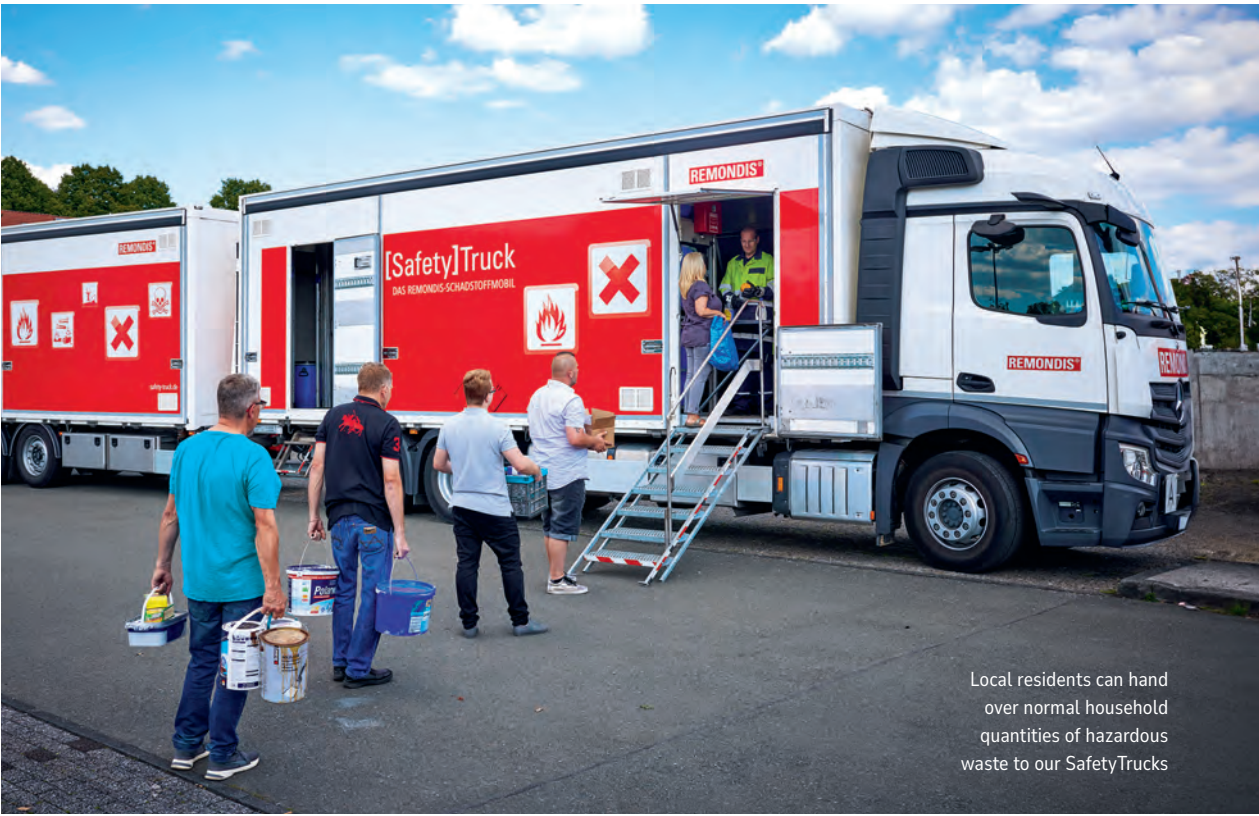
Local residents can hand over normal household quantities of hazardous waste to our SafetyTrucks